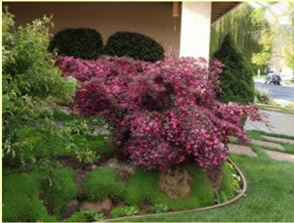
Loropetalum in all its glory in full spring bloom

Don't invest then forget. I am now offering quarterly garden check ups to keep your garden beautiful and healthy.