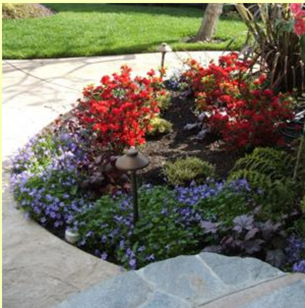
Red Azaleas with blue Campanula at its feet.