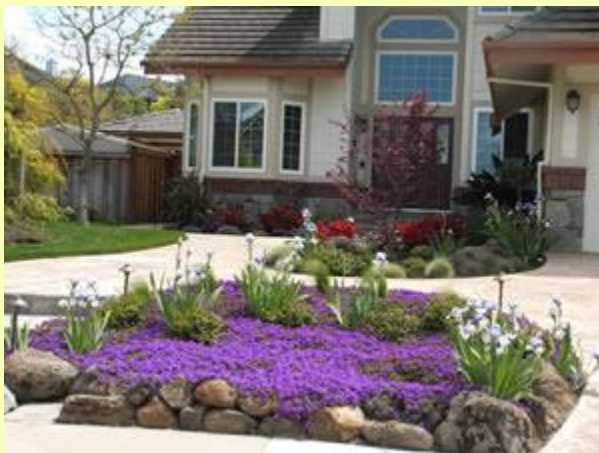
Verbena makes a showy ground cover amongst Bearded Iris.

great this month. Some ideas to grow are Beans, Peppers, Corn, Cucumber, Eggplant, Lettuce, Onions, Peas, Squash, and Tomatoes. Your choice will reflect on what you and your family enjoy eating. This is a fabulous idea if you have children, as they get to grow their own edibles and may eat more vegetables if they are excited about the whole growing experience. And there is nothing like eating something freshly picked, the taste does not compare to anything from the store!!!