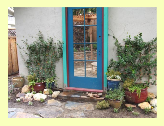
This found door adds a whimsical focal point.

If you need some help applying that little extra to your garden, I'm happy to lend a hand.