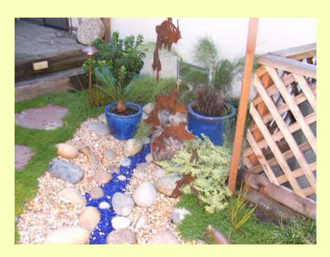
Blue tumbled glass on dry creek bed

You have received this email because you are a friend or client of Outer Visions Landscape Design.