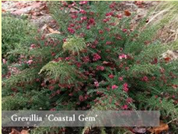
Grevillia 'Coastal Gem'

I can help you update your gardens without creating a drain on our precious water.